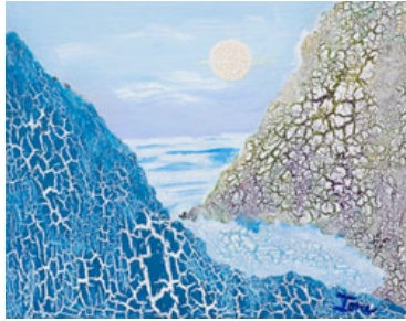
"First Frost" 11"H X 14"W Crackle Nail Polish