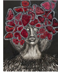
"en Vogue" 20"H x 16"W Crackle Nail Polish