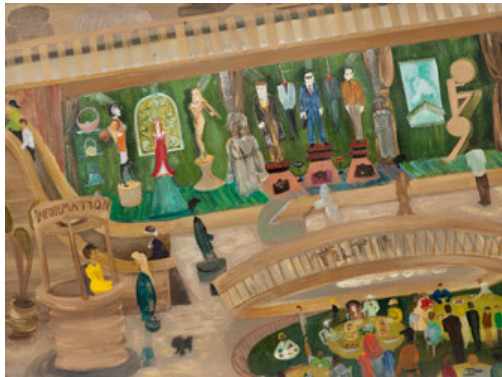
"Tilt Shopping Center" 19" high x 30" wide Watercolor