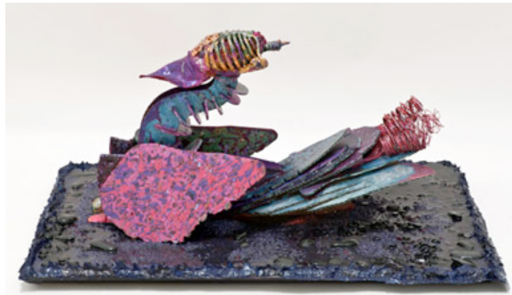
"Anita Ekbird" 20"H X 39"W X 25"D Mixed Media