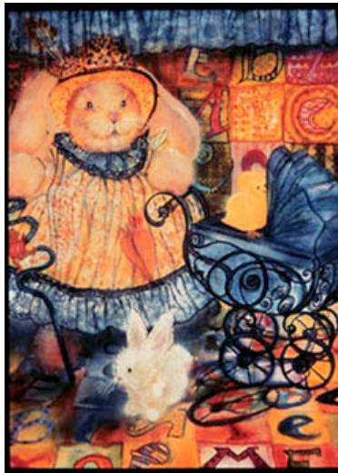
"Bunny Love" 40"H X 30"W Oil on Paper