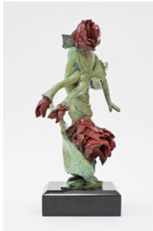
Rose & Bud View 2 16"H X 8"W X 8"D BRONZE