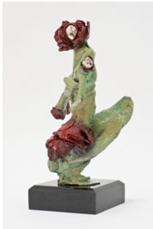
Rose & Bud View 1 16"H X 8"W X 8"D BRONZE