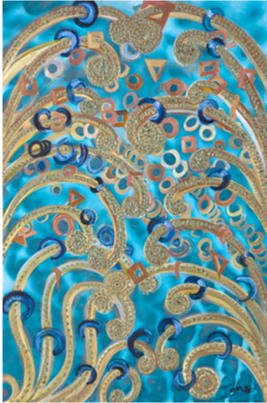
"SUCCULENTS" Acrylic on Canvas 34"H X 24"W

show, her piece "Succulents" is very moving and uplifting with the clearly defined curvilinear patterning and the more amorphous and cool background."