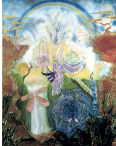
"NEVERLAND" Acrylic on Canvas 46"H X 36"W

5th Place - American Art Awards Online - Fantasy